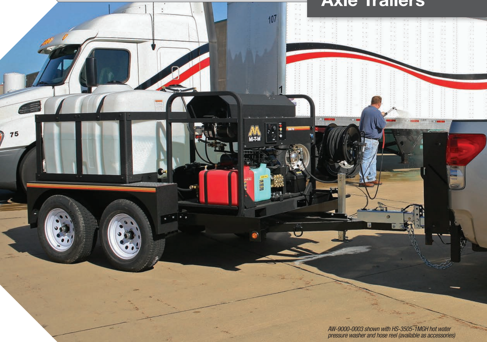
AW-9000-0003 shown with HS-3505-1MGH hot water pressure washer and hose reel (available as accessories)