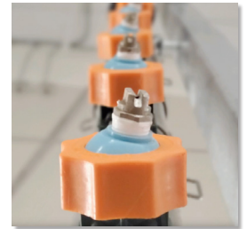
Embedded spray nozzles