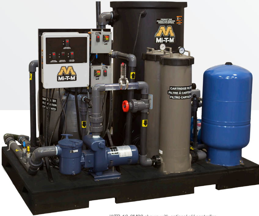
WTR-10-0M30 shown with optional pH controller, WX-0130 and ORP controller, WX-0131

THE COMPACT WTR SERIES SYSTEMS ARE GREAT FOR SMALL WASH BAY SET-UPS. THEY ARE A COST-EFFECTIVE SOLUTION TO FILTER WASH WATER FOR REUSE THROUGH A PRESSURE WASHER OR FOR PROPER DISPOSAL.