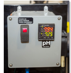
Optional pH controller, WX-0130