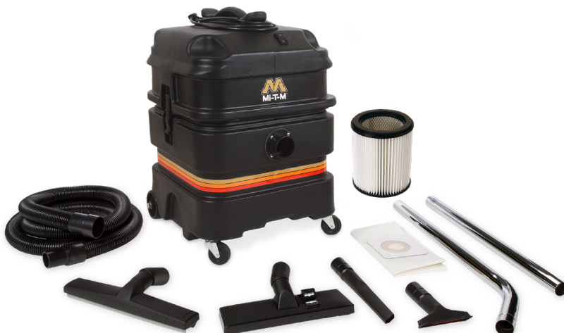
MV-1300-0MEV Shown with standard accessories

These powerful wet/dry vacuums feature a hydro flow filter and are some of the quietest vacuums on the market.