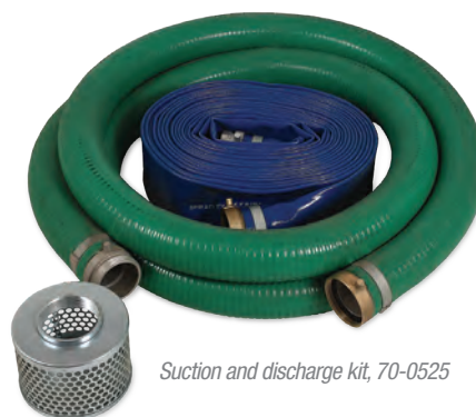
Suction and discharge kit, 70-0525