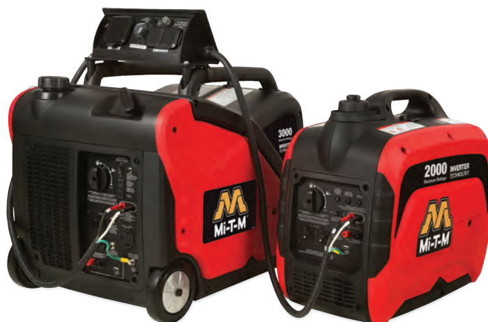
GEN-3000-IMMO and GEN-2000-IMMO shown with parallel port box accessory, AW-5100-0002