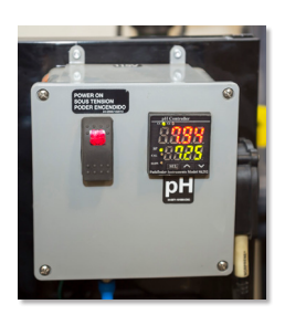
Optional pH controller, WX-0130