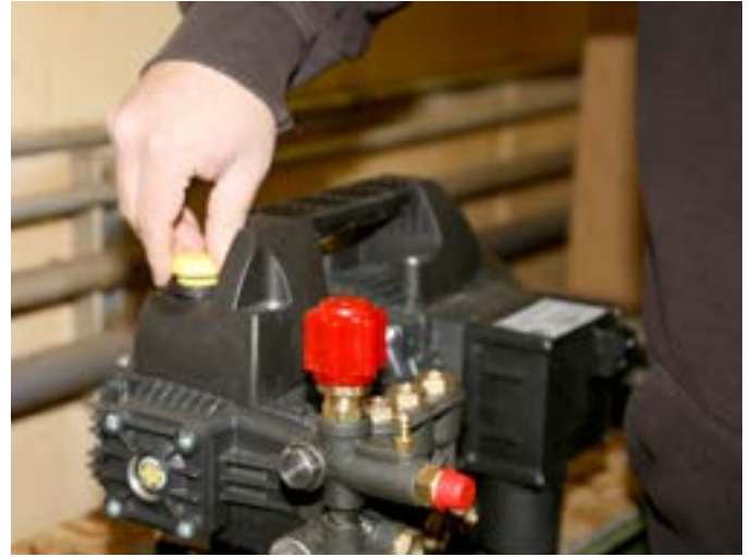
2. Replace with yellow vented oil cap found in accessory bag.