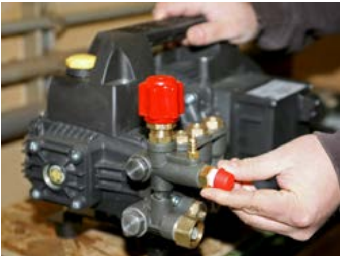
1. Remove red cap from outlet as shown.