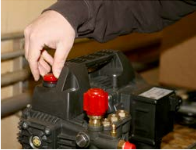
1. Remove red unvented oil cap as shown.