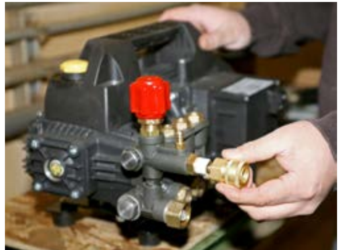
2. Screw on quick connect found in accessory bag.