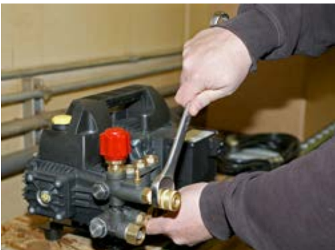
3. Tighten quick connect with 1" wrench.