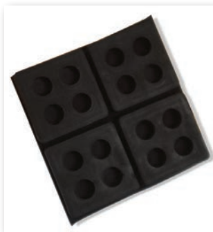
Vibration isolator pads protect the tank from stress