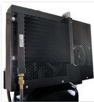
Air-cooled after cooler removes up to 65% of moisture and drops temperature within 10°F of ambient

These standard features are what sets the M Series air compressors apart from our standard line-up.