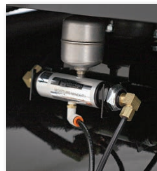
Tank drain automatically drains liquid from the air receiver