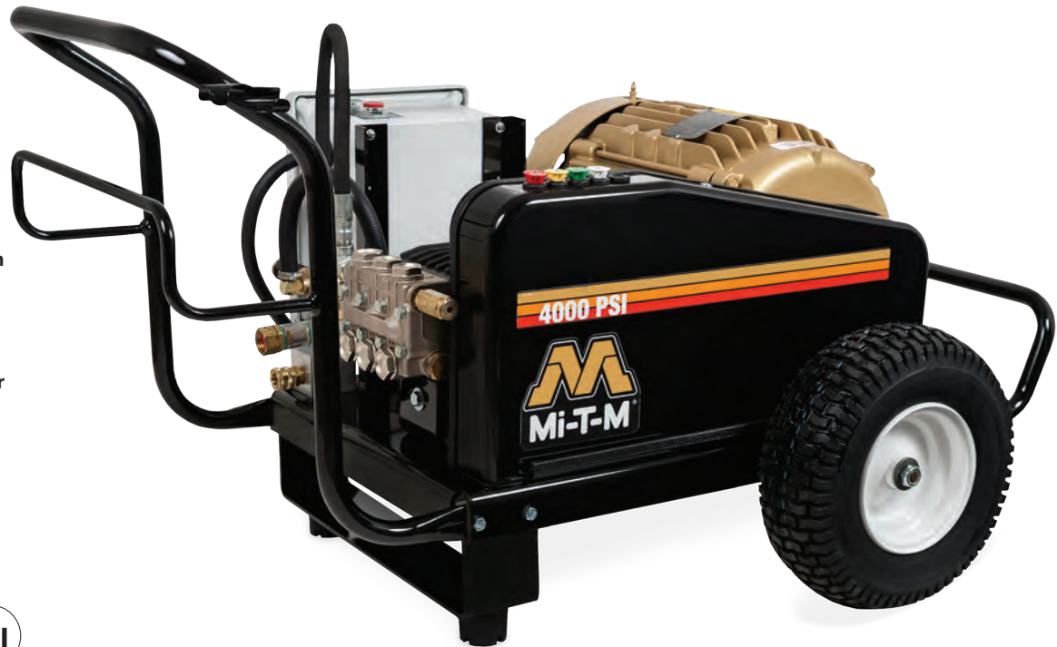
CW-4004-1ME3 shown with 460V, 3-phase motor option, CX-0057