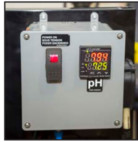
Optional pH controller, WX-0130