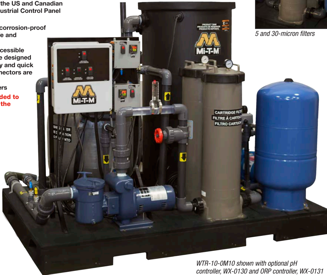
WTR-10-0M10 shown with optional pH controller, WX-0130 and ORP controller, WX-0131